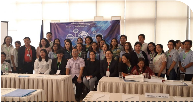
National Library of The Philippines (NLP) Administrators and Working committees together with the participants from University libraries, Special libraries and Public libraries.

In celebration of the 60 th Public Library Day, the National Library of the Philippines (NLP) in cooperation with CE-Logic, Libtech Sources, Inc. and Megatexts Phils., Inc. conducted a half-day forum on Online Databases or known as Electronic Resources on March 11, 2019 at Ramada Manila Central Hotel, Binondo, Manila. Participants and representatives from different University libraries, special libraries and public libraries were present in the venue including the ten (10) QCPL employees.