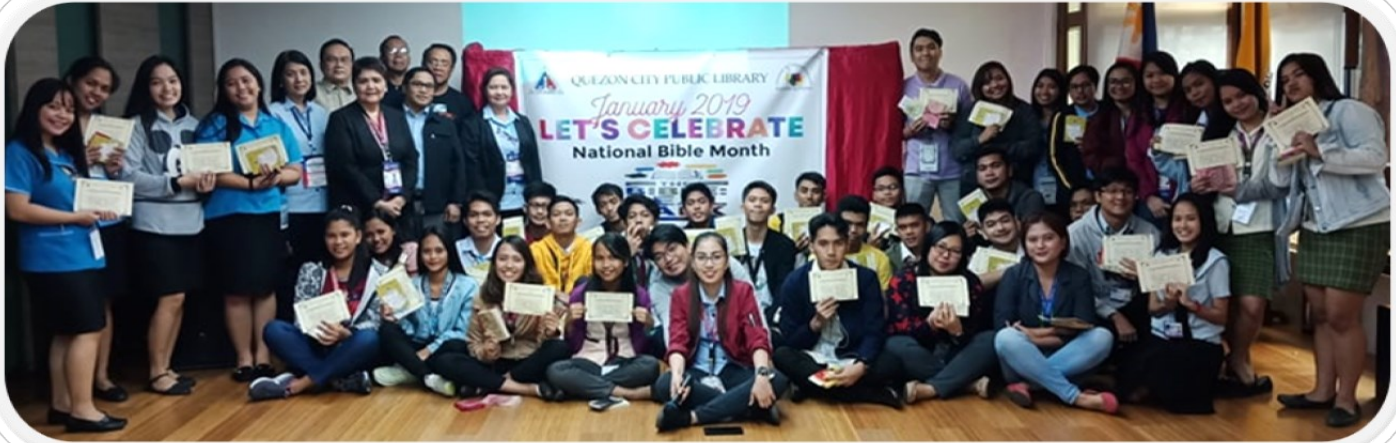
The youth participants together with the organizers and facilitator

Every year, the nation commemorates and celebrates the importance of the Bible in nation building. Proclamation No. 124 of President Rodrigo Roa Duterte, declared the whole month of January of every year as National Bible Month. This annual event started in 1982 after former President Ferdinand E. Marcos signed Presidential Proclamation No. 2242 declaring a nationwide Bible celebration. President Marcos originally declared the first Sunday of Advent and the last week of November every year as National Bible Sunday and National Bible Week (NBW). But through the years, with the transition of our Presidents it was transferred, made official