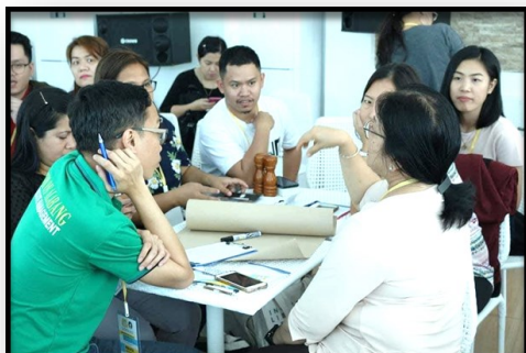
Brainstorming with my group at the seminar activity