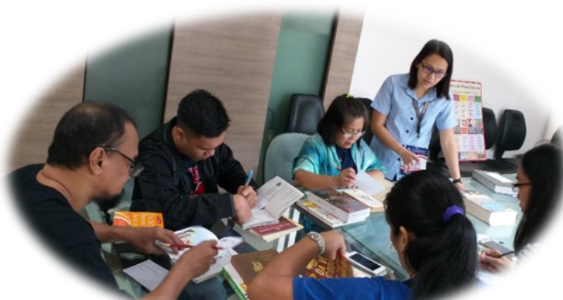
The trainer guiding the participants on descriptive cataloging

ing for the establishment of congressional, city and municipal libraries and barangay reading centers throughout the Philippines and why library is important to the community. The barangay staff walk through different types of libraries, library's functions, services, sections and collections. They were guided to formulate guidelines, rules & regulations for