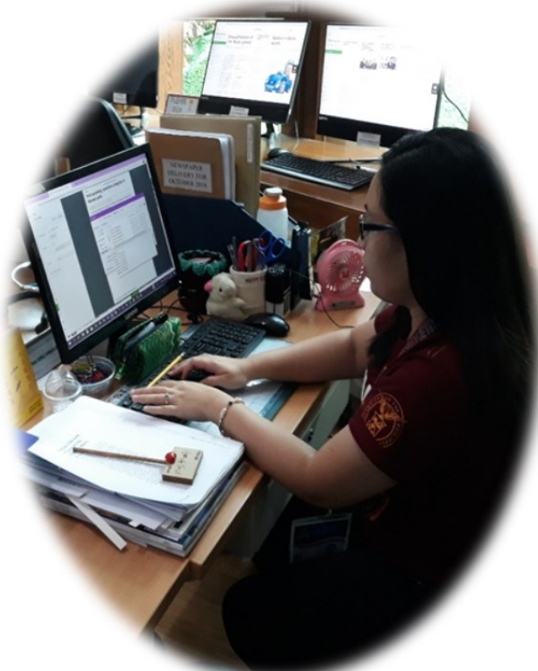
Online clippings using PressReader

it is produced in a hard copy. It is costly because it needs a lot of resources like paper, glue, scissors just to produce a copy of the newspaper articles. Thus, we have to innovate and be creative to better serve of clientele. Serve them the fastest way for them to access information.