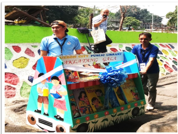
Aklatang Gala at the road bringing stories where the children's are